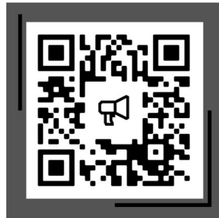
Resurrection Podcasts Revealed Podcast & Auditio Divina Podcast