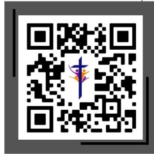
Resurrection App Apple App Store & Google Play Store