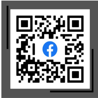
Resurrection Facebook facebook.com/gbresurrection