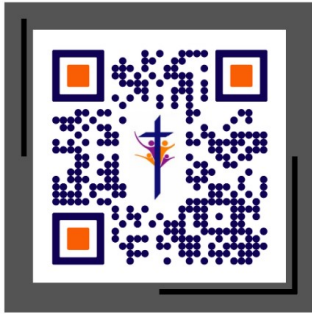
Resurrection Website www.gbres.org